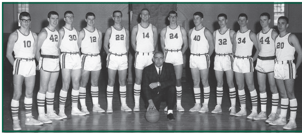
1965 A State Basketball Champions Marquette High School Squires