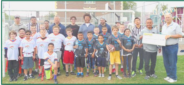
Madison House flag football league with players in action below.