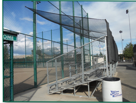
Helping at the parks with safety netting